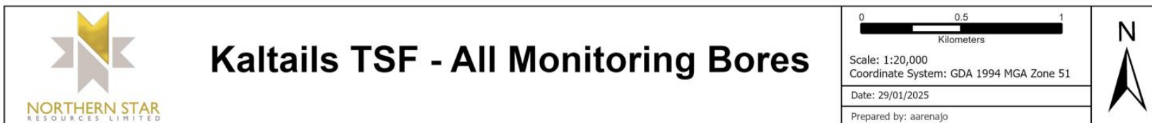
Figure 2. Location of Kaltails TSF Groundwater Monitoring Bores