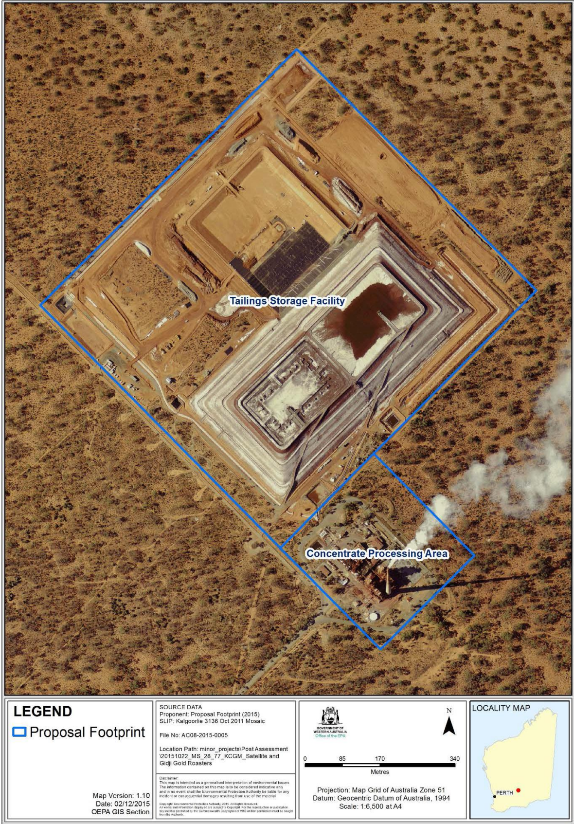
Figure 2: Disturbance Boundary