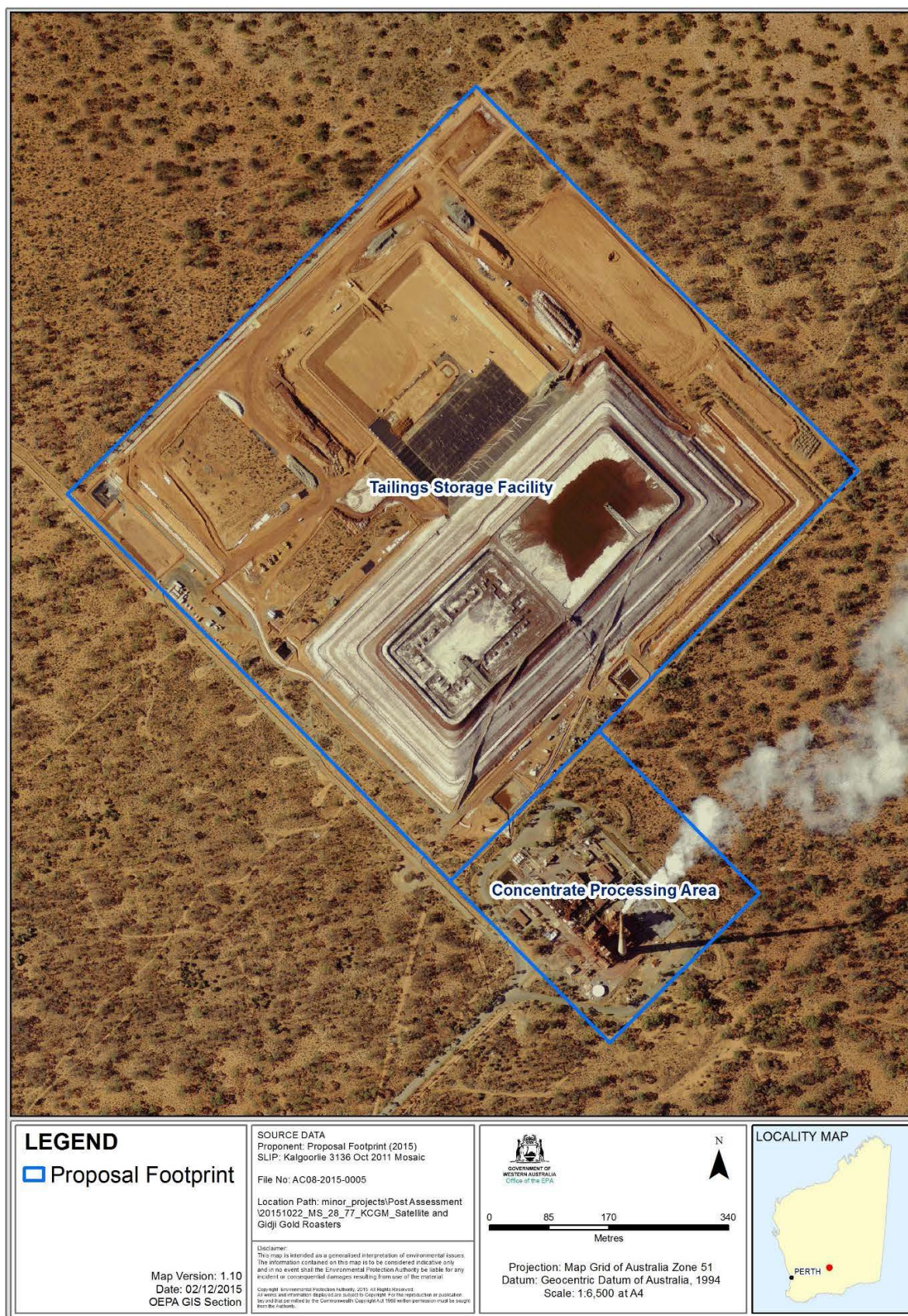
Figure 2: Disturbance Boundary