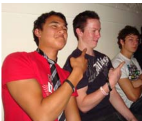
DSC01216 – More than 100 people attended the 2008 KCGM Blast Off, and the youth crowd enjoyed the nights' entertainment.