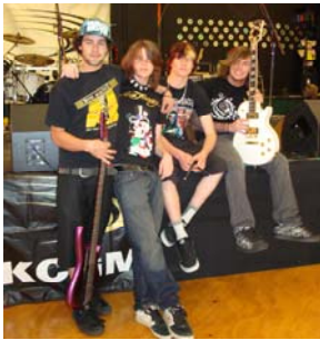
Artillery for Children – Artillery for Children ready to battle it out in the 2008 KCGM Blast Off